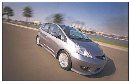
The 2009 Honda Fit Sport is remarkably spacious inside.

The first and lasting impression of this 13.5-foot-long car is how spacious the interior feels. Because the Fit is a full 5 feet tall, there's as much headroom in the front seat — 40.4 inches — as in the front seat of a 2009 Cadillac Escalade. Two adults can be comfortable in the back seat. Three adults fit snugly. But everyone gets an adjustable head restraint.